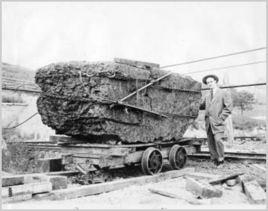
Fig. I.1. "Block of Fairmont Coal." This photograph appeared in the CCC Mutual Monthly Magazine , April 1924, with the following caption: "Block of coal recently taken from Mine No. 22, W. Va., for shipment to Italy, where it will be placed on exhibition. This is one of the largest blocks of coal ever removed from a West Virginia mine. It is 8 ft. 6 in. high by 4 ft. 6 in. wide by 4 ft. 6 in. thick and weighs approximately 6½ tons."

thousand tons to over one million tons per year. By 1851 production had soared to 10 million tons, and by 1860 the figure stood at 20 million tons. The advent of coal-burning locomotives led to the extraction of 110 million tons in 1885 and 243 million tons in 1900, by which time the United States had become the world's leading producer. To put it bluntly, as historian Duane A. Smith has done, "Without mining—from coal to iron to gold—the United States could not have emerged as a world power by the turn of the century, nor could it have successfully launched its international career of the twentieth century." Historically, Appalachia's coal-fields contributed mightily to America's emergence as an industrial power (fig. I.1). 5