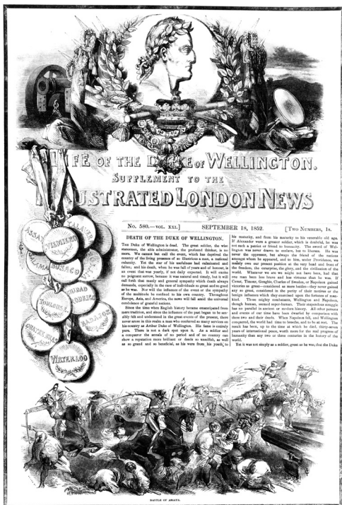
FIGURE 0.1 Special mast-head, Illustrated London News , “Life of the Duke of Wellington” supplement, 18 September 1852.