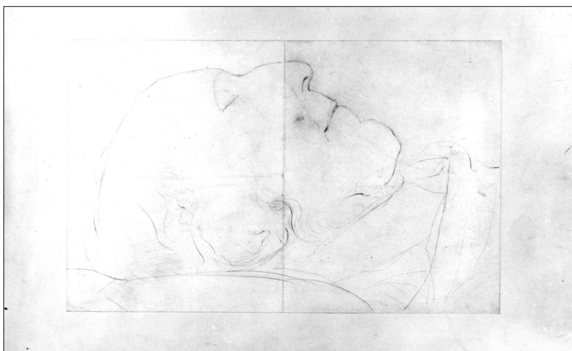
FIGURE 0.2 The Duke of Wellington, after Death , camera lucida sketch by Thomas Milnes, 1857.