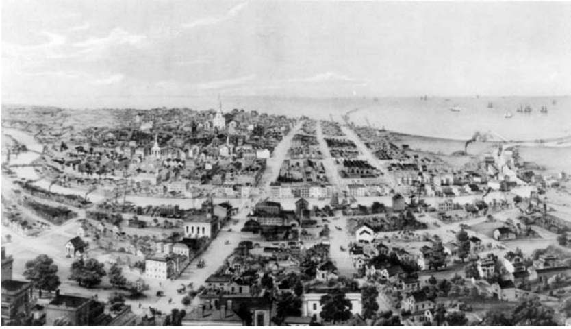
Figure 1.1. Bird's-eye view of Milwaukee, 1853.