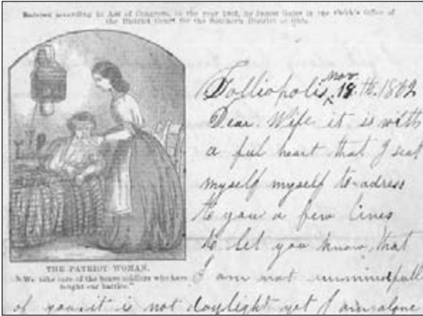
Civil War stationery symbol.